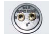
Duplex bushing 3/8"-1/2"