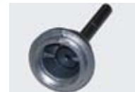
Vent alarm 2" NPT