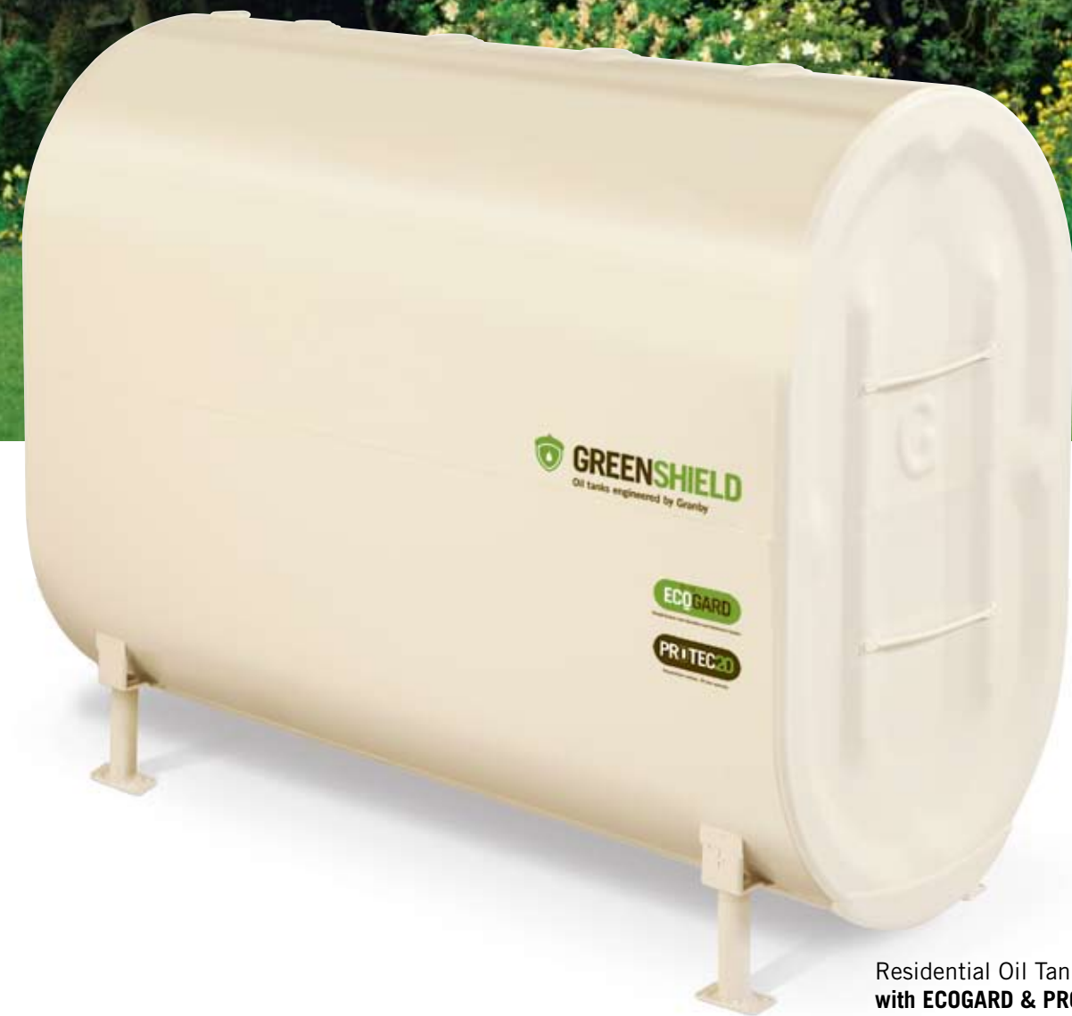
Residential Oil Tanks with ECOGARD & PROTEC 20