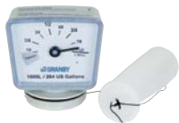
Gauge PN: 962247 – 720 L / 190 USG 962248 – 1000 L / 265 USG